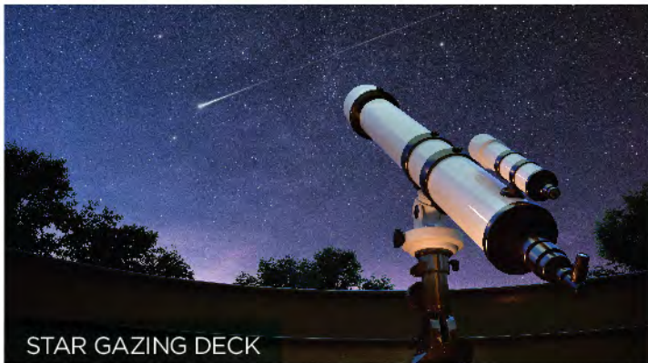
STAR GAZING DECK