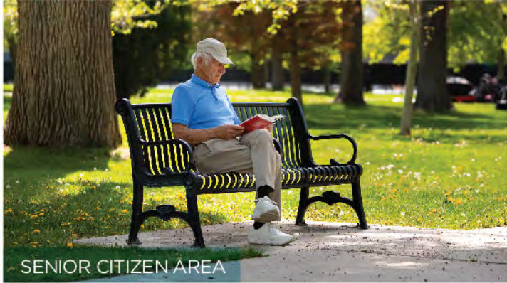
SENIOR CITIZEN AREA