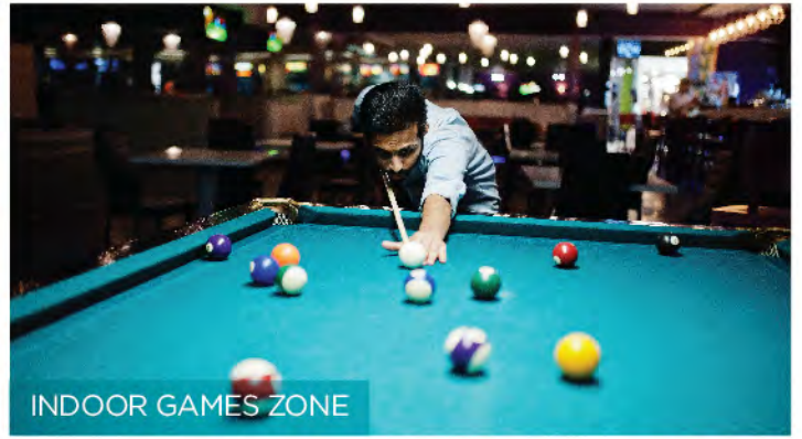
INDOOR GAMES ZONE